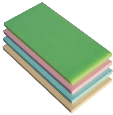
① グリーン ② ピンク ③ ブルー ④ ベージュ