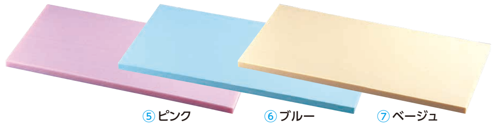
⑤ ピンク ⑥ ブルー ⑦ ベージュ